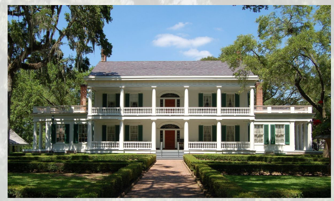
Rosedown State Historic Site

The Symposium has provided financial support to regional gardening efforts and a scholarship for horticulture students at LSU, keeping with its mission to enrich gardeners with knowledge and to provide resources promoting the art of gardening.