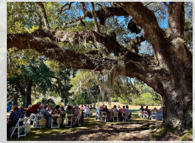
On Friday, guests will enjoy lunch under the Barrow Oak at Afton Villa Gardens.

Enjoy an evening at Harlow Farms and mingle with speakers and guests at a gracious private residence.